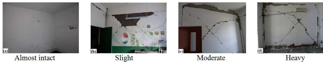
Figure 4. Seismic damage grade of infilled wall.