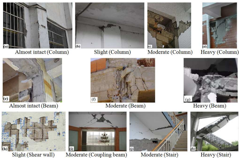
Figure 5. Seismic damage grade of RC structural elements.